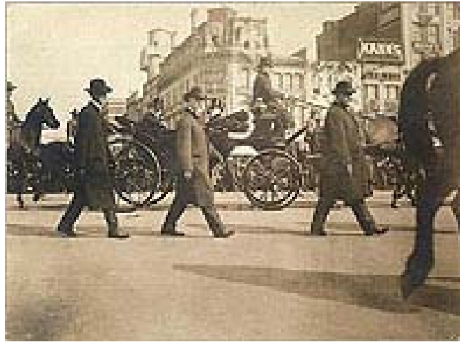
Theodore Roosevelt- 1901