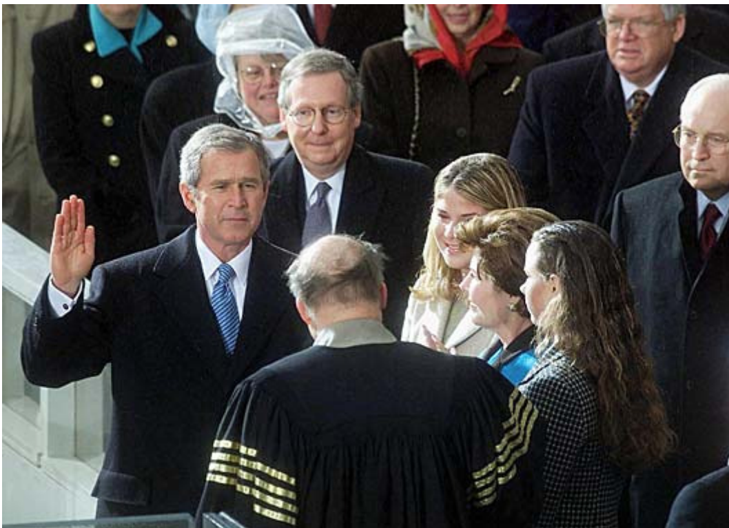
2001 Inauguration of George W. Bush, Encarta encyclopedia.