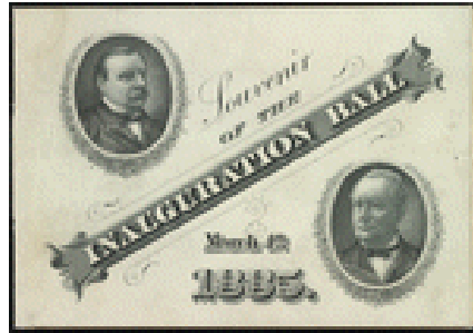
Grover Cleveland- 1885