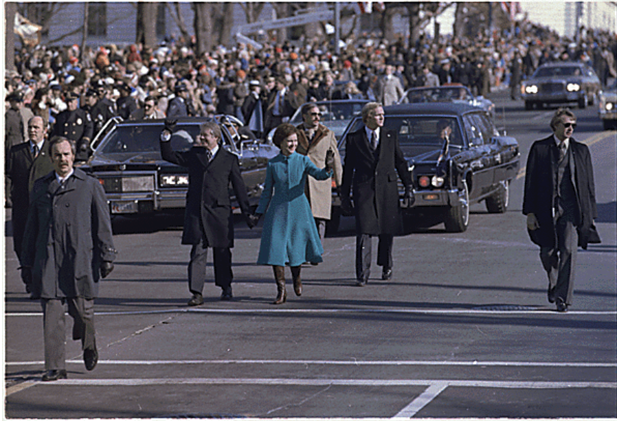
Jimmy Carter- 1977