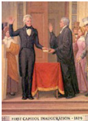
Andrew Jackson- 1829