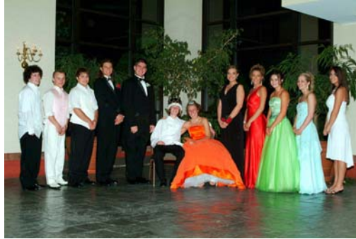
Pictured is the Prom Court: (from left to right)

The Greenwich Central School Class of 2006 held their Junior Prom on Saturday, May 28 th . The coronation was held in the High School auditorium, followed by the prom "Time After Time" at the Prime Hotel in Saratoga Springs.